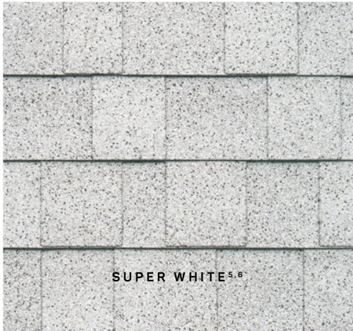
SUPER WHITE 5, 6

IMPORTANT! To ensure complete satisfaction, please view several full-size shingles and an actual roof installation prior to final color selection as the shingle swatches and photography shown online, in our brochures and in our app may not accurately reflect shingle color and do not fully represent the entire color blend range, nor the impact of sunlight.